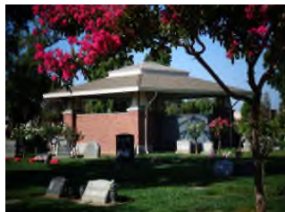
Attractive features such as the Garden Niche, (left) and a natural pond with waterfall and island highlight the grounds of Roseville Public Cemetery District