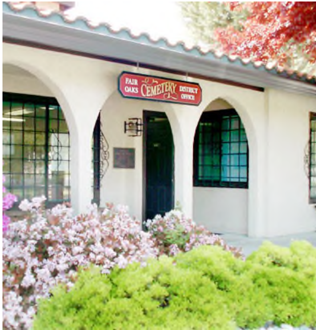
Fair Oaks Cemetery District Hosted Suicide Awareness Training