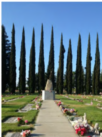
A Veteran's niche stands tall over the grounds at Winton Cemetery District.

"...after 10 days of trial, a Merced County jury voted unanimously that the Winton Cemetery District was not liable.."