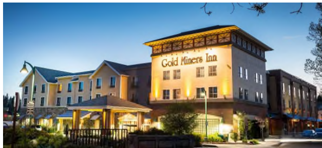
Gold Miners Inn, Grass Valley, CA will be the event site for the 2018 PCA Annual Meeting